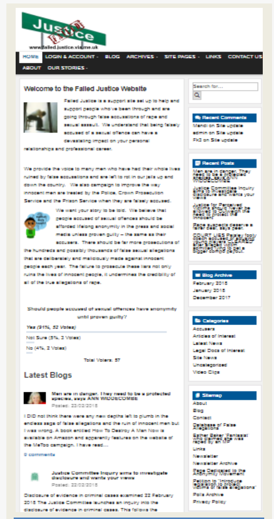
Above is a screenshot of the website at time of writing.

We want your story to be told. We believe that people accused of sexual offences should be afforded lifelong anonymity in the press and social media unless proven guilty – the same as their accusers. There should be far more prosecutions of the hundreds and possibly thousands of false sexual allegations that are deliberately and maliciously made against innocent people each year. The failure to prosecute these liars not only ruins the lives of innocent people, it undermines the credibility of all of the true allegations of rape.